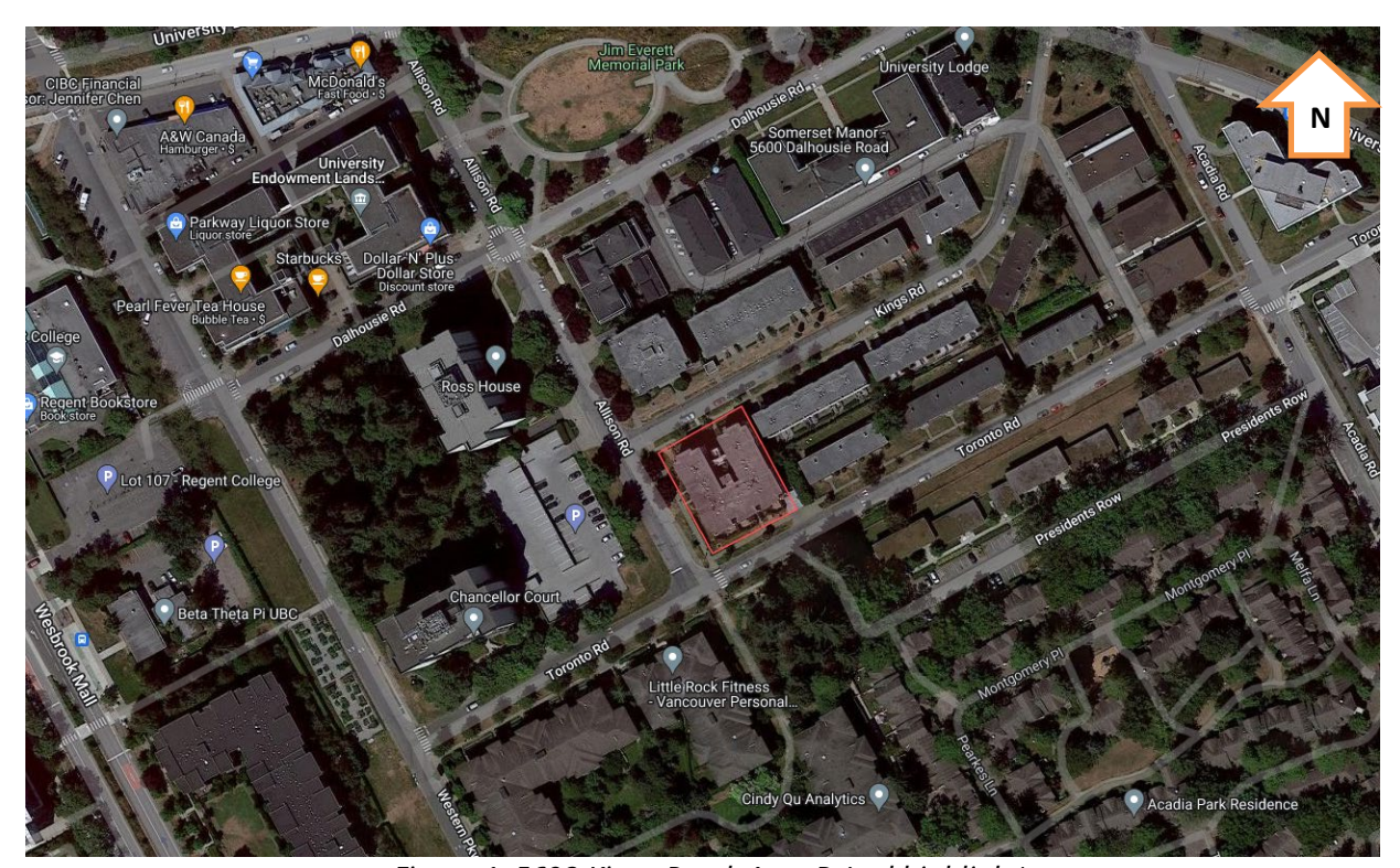
Figure 1: 5692 Kings Road, Area D (red highlight).