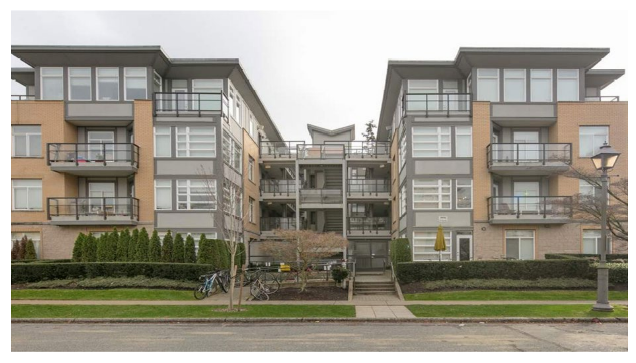
Figure 3: Existing Street view looking south of 5692 Kings Road, Area D.